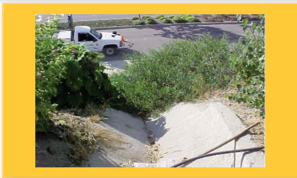
V-ditch in need of vegetation removal.

City of Camarillo residents are encouraged to get ready for the coming rainy season by ensuring that slopes on their property are maintained and drainage facilities are properly cleaned out and kept clear of debris. Failing to maintain private slopes or drainage facilities, such as V-ditches, drain inlets and lines, may result in damage to the homeowner's property as well as to downhill neighbors.